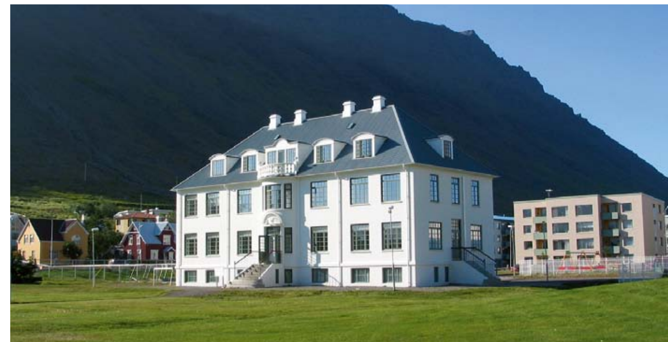
The old hospital has been converted into a museum and a library.

You can choose whether you walk aimlessly through town, pick your sites in advance, or ask the helpful staff of the Information office to recommend places for you to visit.