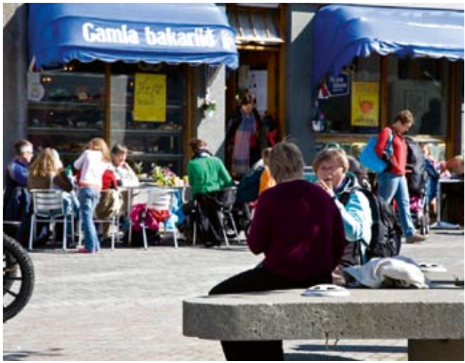
Ísafjörður, the Old Bakery in town centre.

The village Suðureyri is located by the fjord Súgandafjörður. It is home to around 300 people and is known as "The original fishing village". Being close to rich fishing grounds, fisheries have always been the most important industry in this friendly and peaceful village, although tourism has played an increasingly important role in recent years, especially with the growing number of sea angling tourists who visit Suðureyri and Flateyri in drones every year.