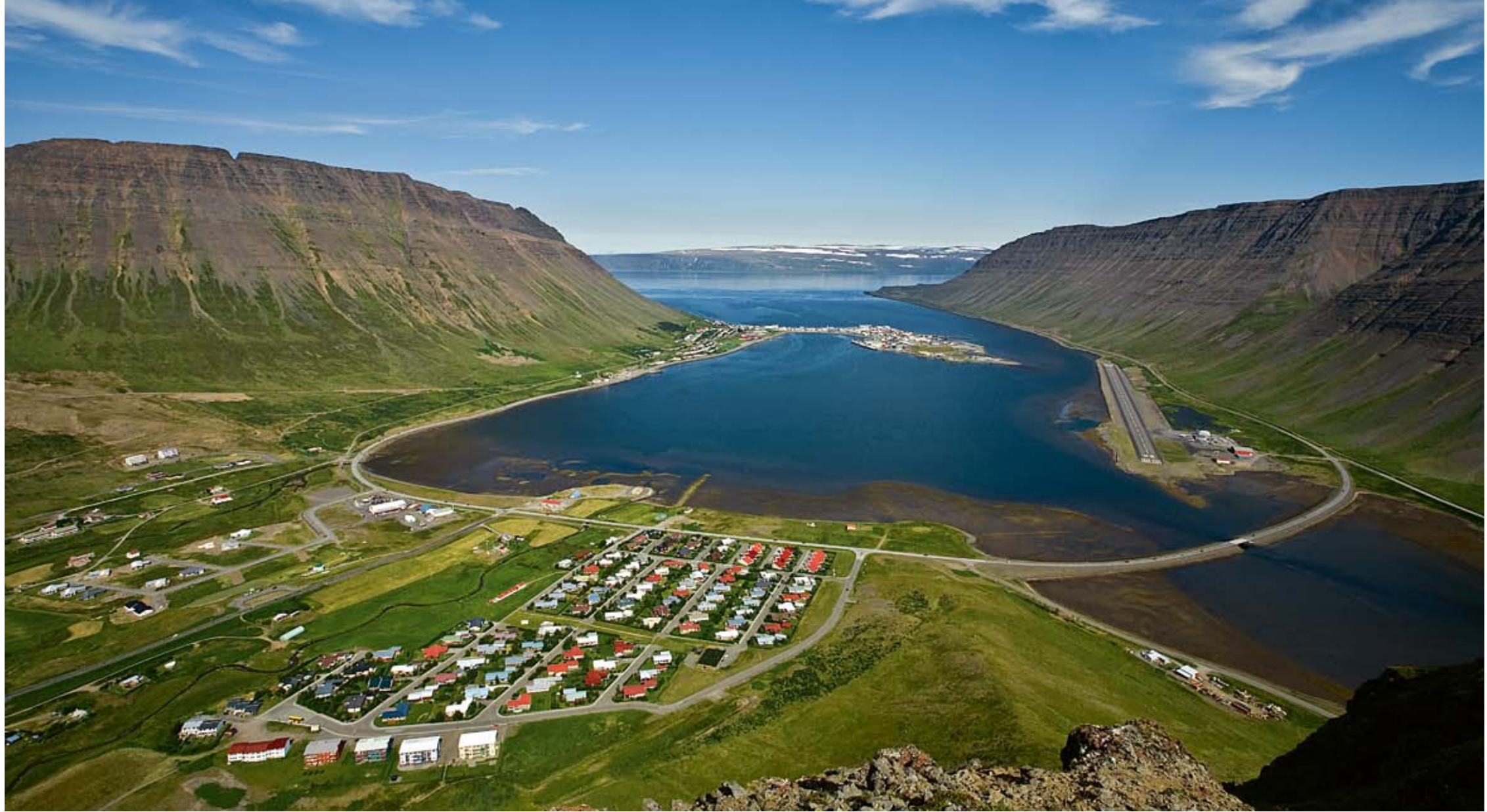
The approach to Ísafjörður airport is a little unconventional.