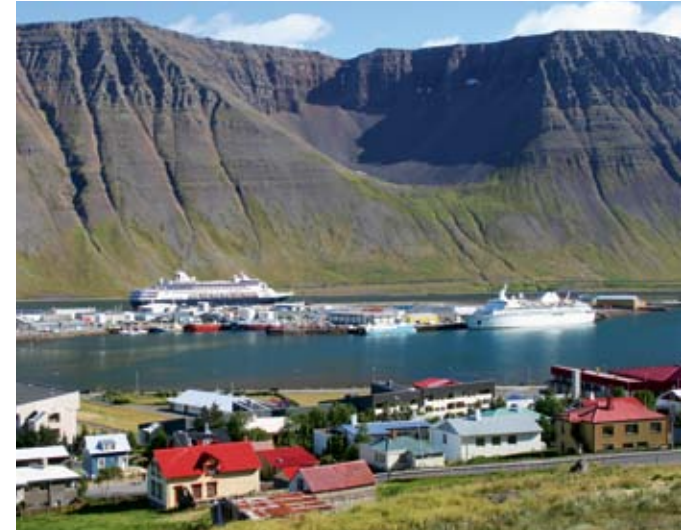
Maasdam at Sundabakki and Van Gogh (near) at Ásgeirsbakki.